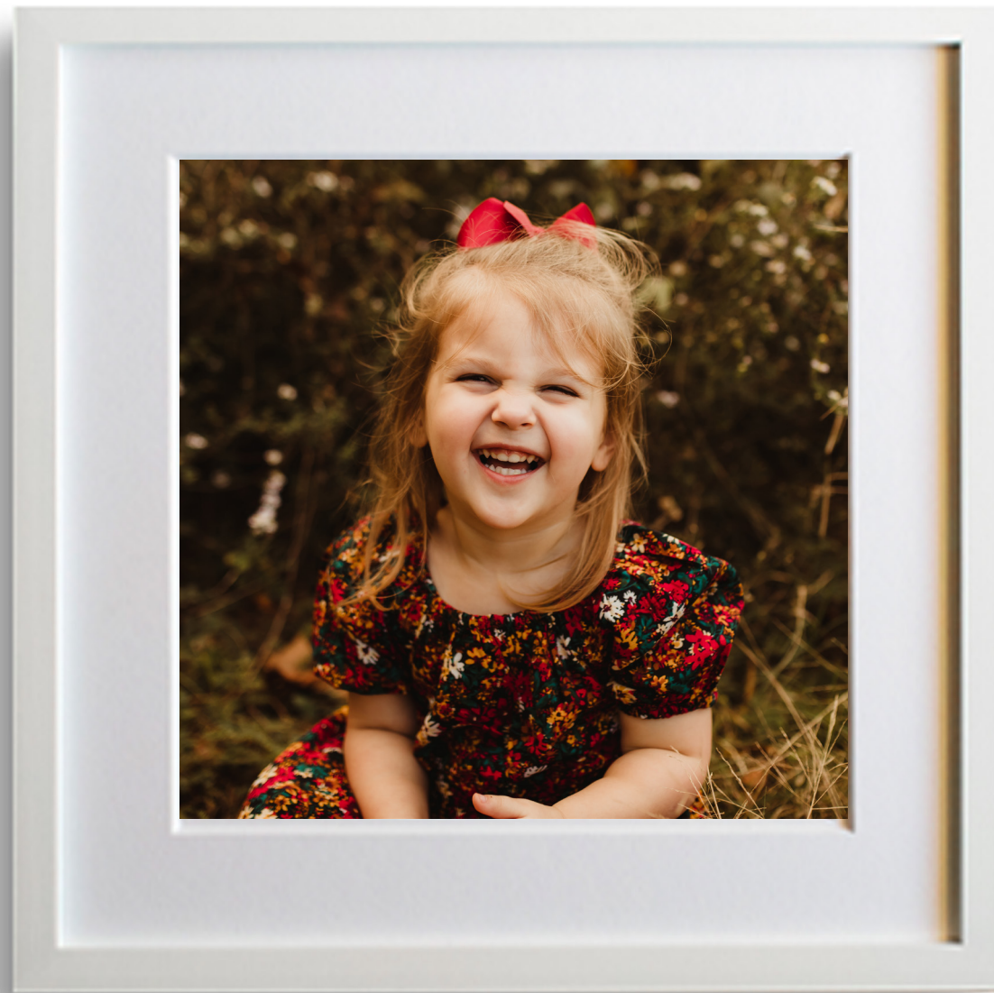
Fine art print. Expertly selected handcrafted frame. Archival mat. UV protected. Ready to hang.

One or many. The beautiful All White fits into nearly any space: large to small, rustic to modern. You're sure to love it through countless style changes and home moves. Decorate your home consistently over time by investing in an All White from each of your sessions with Ivy B Photography, or choose to create a statement piece by creating a gallery wall with multiple All Whites from one session.