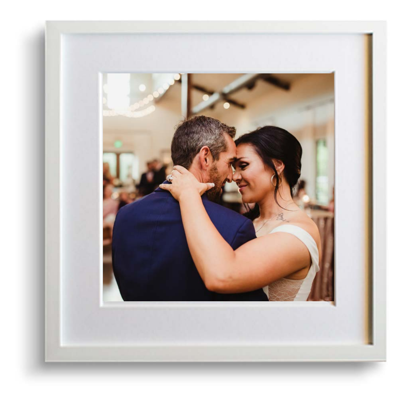
Fine art print. Expertly selected handcrafted frame. Archival mat. UV protected. Ready to hang.

One or many. The beautiful All White fits into nearly any space: large to small, rustic to modern. You're sure to love it through countless style changes and home moves. Decorate your home consistently over time by investing in an All White from each of your sessions with Ivy B Photography, or choose to create a statement piece by creating a gallery wall with multiple All Whites from one session.